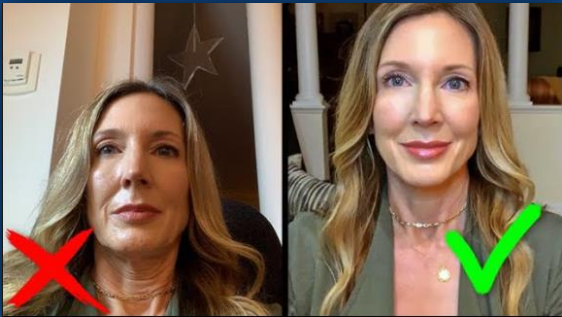
Center your frame & adjust the webcam at eye-level